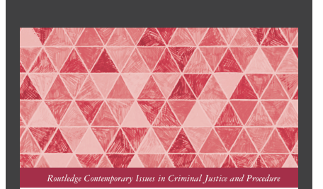
MURDER, WRONGFUL CONVICTION AND THE LAW AN INTERNATIONAL COMPARATIVE ANALYSIS